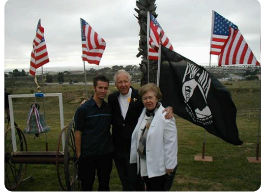
Iwo Jima ceremony