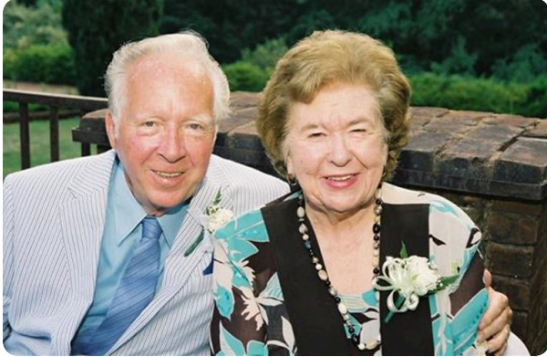
Mom and Dad